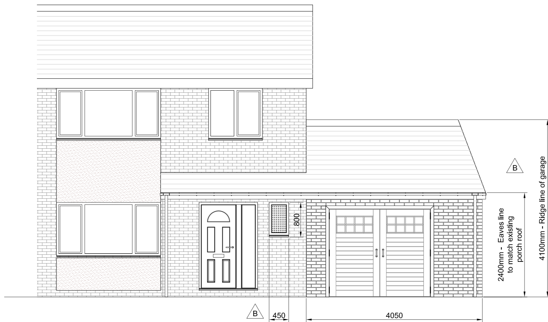
Proposed Front Elevation – Scale 1:50