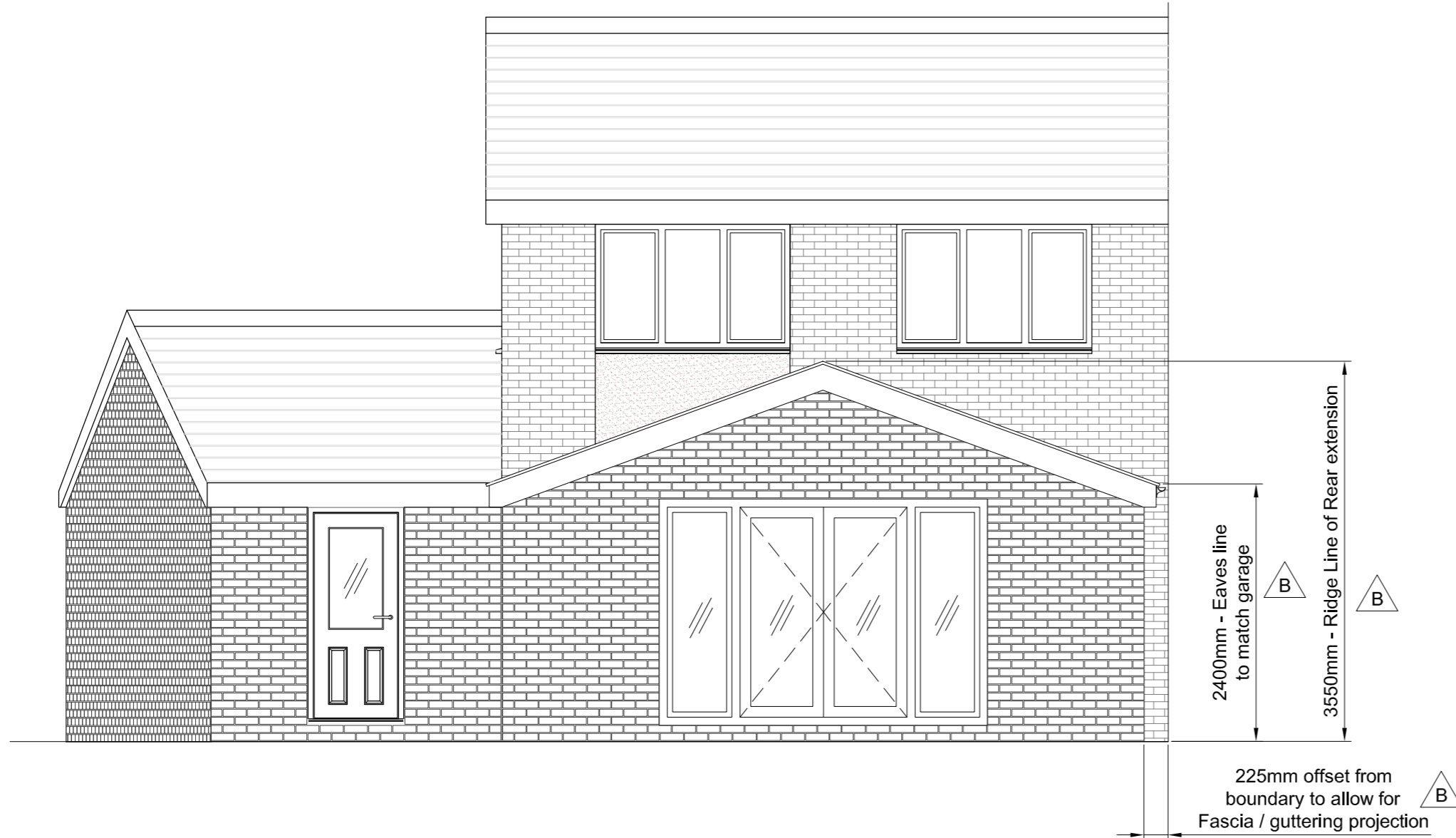
Proposed Rear Elevation – Scale 1:50